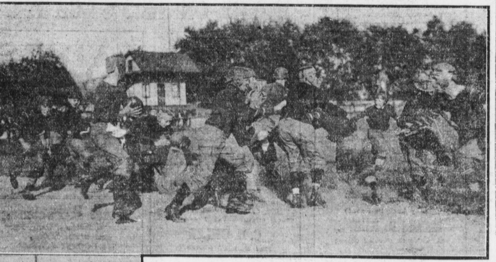
The upper etching shows Gallagher, of Elizabethville, about to make a forward pass. The lower is Rote, of Central, kicking a goal.