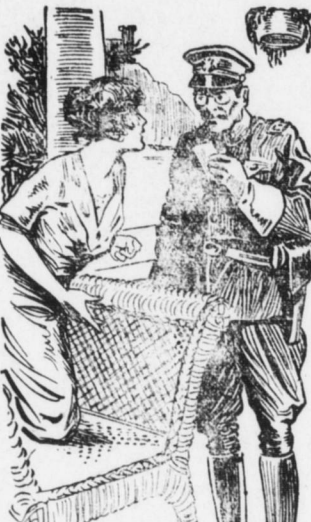
"Why Do You Want to Save the Women?"

You Cannot Afford to Miss This Extraordinary Offer Glasses regularly sold at $5.00, for $1.00 New style Staytite, finger mounting, regularly $5.00, for $2.00