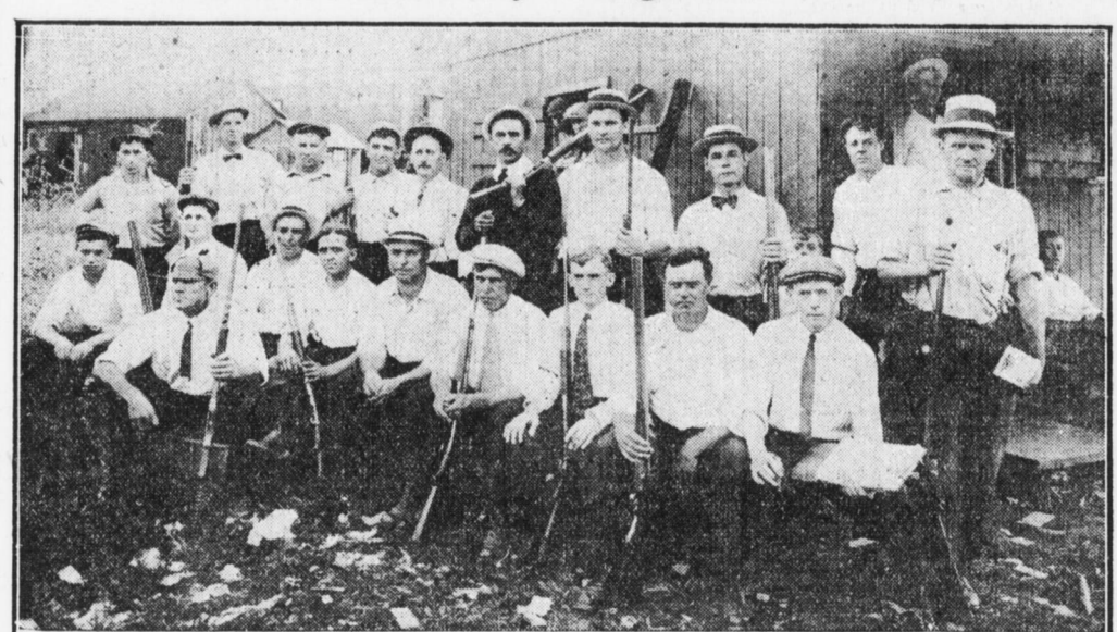
When the next big shoot is held in Harrisburg the list of crack shots will show a big increase, for a new organization, the West Fairview Shooting Association has been showing great activity.