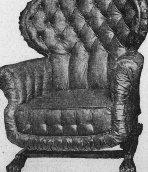
Turkish Rocker, covered with imitation brown Spanish $10.95 leather; regular $12.50 value $8.95 Special .....