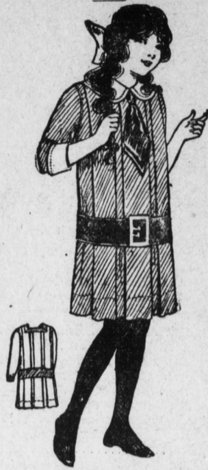
8345 Girl's Dress, 6 to 10 years.