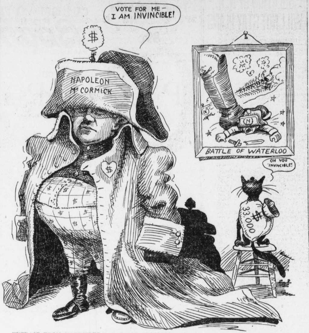
EXTRACT FROM HARRISBURG PATRIOT EDITORIAL—"Vance C. McCormick is invincible in the fight for the governorship of the state."