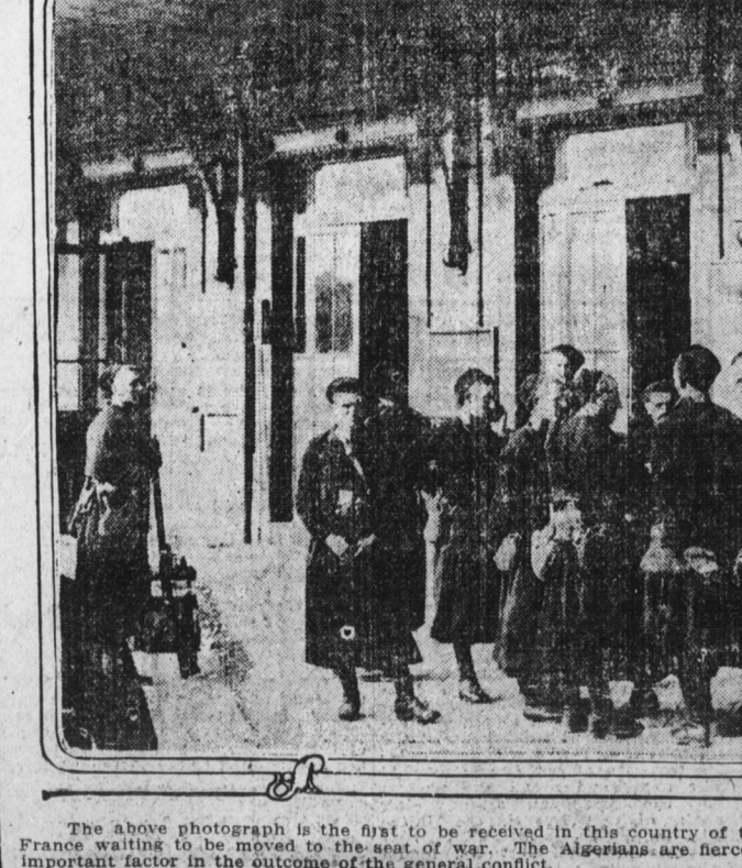
The above photograph is the first to be received in this country of the famous native Algerian troops of France waiting to be moved to the seat of war.