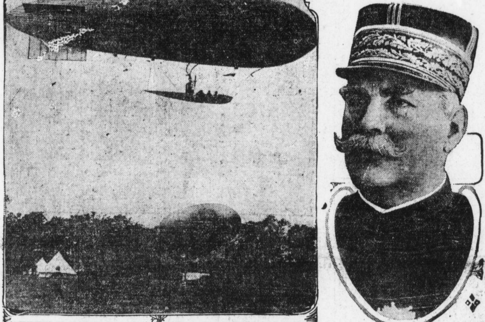
Giant Zeppelin airship, (above) which will be used by Germany in her invasion of Russia, the English dirigibles Gamma and Beta, and General Joffre, the French war commander, who will have charge of the French aerial fighters.