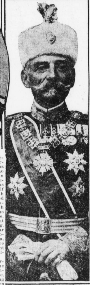
CZAR NICHOLAS OF RUSSIA

WHEAT MARKET BREAKS AND PRICES TAKE SHARP DROP Early Trading Shows Fall of Nearly Five Points; Partial Recovery