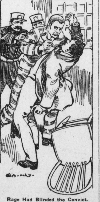
Rage Had Blinded the Convict.

CHAPTER VIII. "Munted." MONTGOMERY traveled all night and with morning dropped off on the outskirts of a little New Jersey village. He remained in the woods all day, determined that the good start, so providentially given him, should not be lost through any lack of caution on his part.