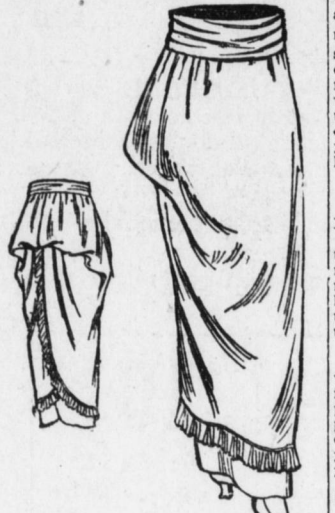
8225 Draped Skirt, 24 to 32 waist. WITH HIGH OR NATURAL WAIST LINE.

Another Style of Drapery Recently Come Into Great Favor