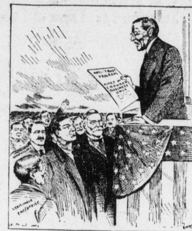
From the Patriot of July 4