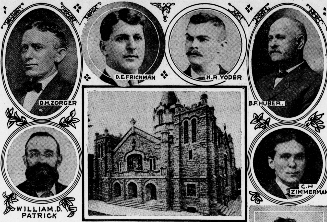
THE AUGSBURG LUTHERAN CHURCH.