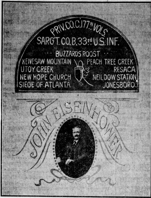
THE VETERAN AND HIS TOMBSTONE PLATE

Civil War Veteran Wants to Be Sure That the Facts Are There and That They're Right