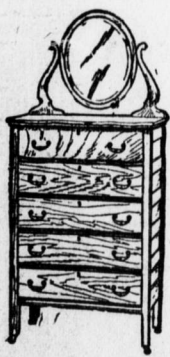
—BOWMAN'S, Fifth Floor.