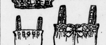
8278 Corset Cover, Small 34 or 36, Medium 38 or 40, Large 42 or 44 bust.

Pretty corset covers may safely be counted among the garments of which there is never a sufficient supply. This one is so simple and can be made so easily and quickly that it is an easy matter to add a generous number to the supply on hand.