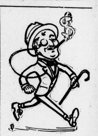
The great question is not so much what money you have in your pocket as what you will buy with it.—Ruskin.

FORMS NEW CABINET: Paris, June 9.—Senator Alexander Felix Ribot announced this morning that he had succeeded in forming a new French cabinet to succeed that of Premier Gaston Doumergue.