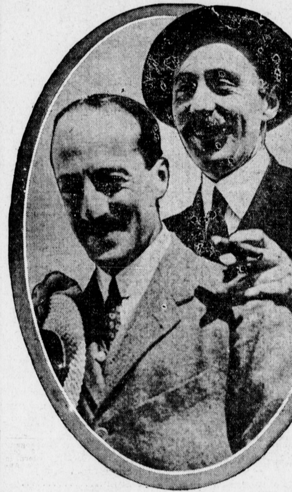
LORD WIMBORNE LUKE OF PENARANDA