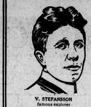
V. STEPANSON famous explorer "Tuxedo is mild, cool and soothing—just the sort of tobacco I need. Tuxedo goes with me wherever I go."