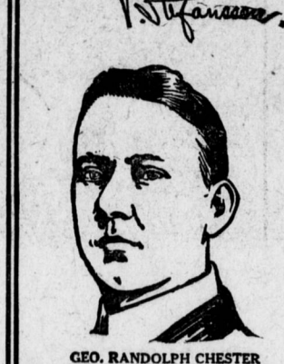
GEO. RANDOLPH CHESTER famous author "Why shouldn't a man be willing to recommend a tobacco which gives as cool, sweet and satisfying a smoke as Tuxedo?"