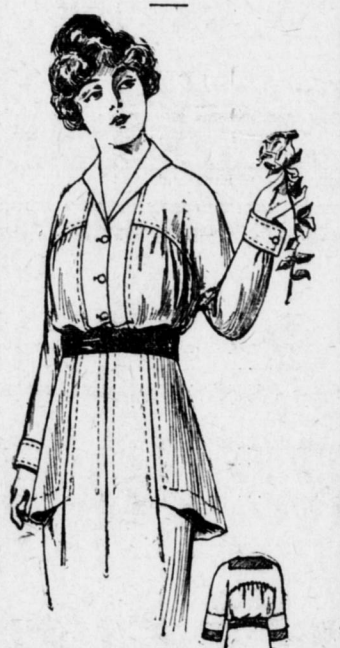
8251 Blouse with Yoke, 34 to 44 bust. WITH LONG OR THREE-QUARTER SLEEVES.

Silk and Crepe De Chine Are Worn as Well as Soft Cottons