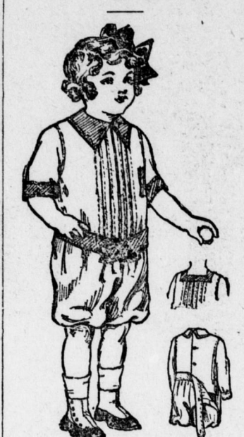
8249 Child's Rompers, 2 to 6 years.

WITH ROUND OR SQUARE NECK, SHORT OR LONG SLEEVES. Pretty little rompers such as these can be made from plain serviceable material and worn during the morning hours or they can be made from white linen or white galatea and be quite dressy enough to be worn during the afternoon. The tucks at the front make an attractive finish and provide fullness for the bloomers. The plain sleeves are stitched to the armholes. For the 4 year size, the rompers will require 3 1/2 yds. of material 27, 2 1/2 yds. 35, 1 1/2 yds. 44 in. wide, with 1 1/2 yds. 27 for trimming. The pattern 8249 is cut in sizes for 2, 4 and 6 years. It will be mailed to any address by the Fashion Department of this paper, on receipt of ten cents.