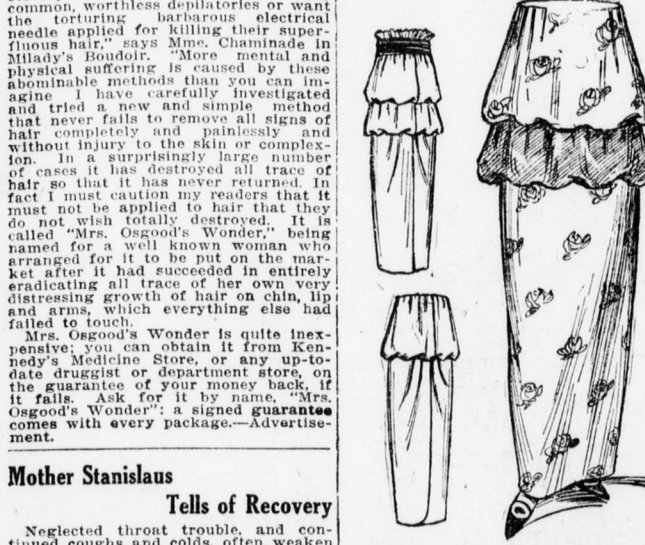
8246 One-Piece Skirt with Yoke. 22 to 30 waist.

Sweet Barrel Effect Is Obtained in This Ultra-modish "I have the greatest trouble with correspondents who insist on using common, worthless depilatories or want the torturing barbarous electrical needle applied for killing their superfluous hair," says Mme. Chaminade in Milady's Boudoir. "More mental and physical suffering is caused by these abominable methods than you can imagine I have carefully investigated and tried a new and simple method that never fails to remove all signs of hair completely and painlessly and without injury to the skin or complexion. In a surprisingly large number of cases it has destroyed all trace of hair so that it has never returned. In fact I must caution my readers that it Garb