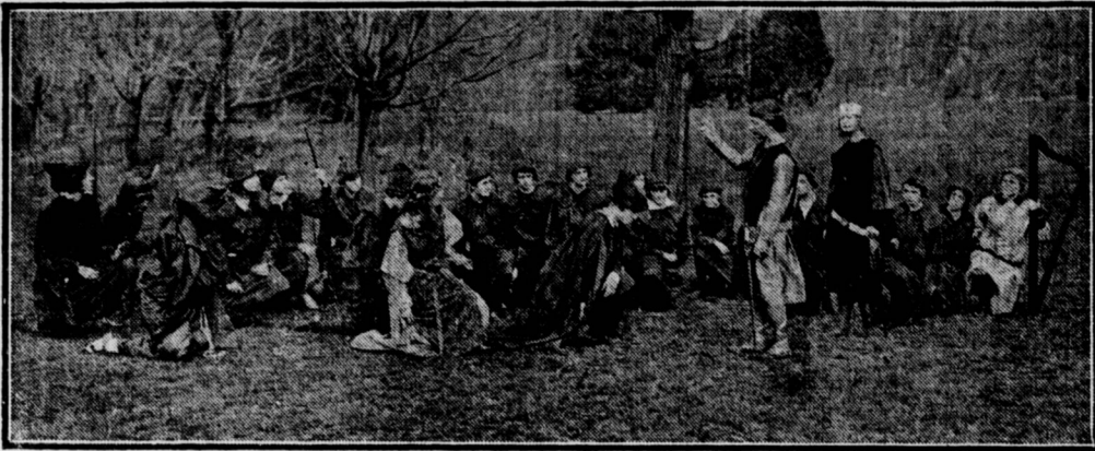
PLAYERS IN "CAMPASPE," BY JOHN LYLTY, 1584

The May Day festival which Bryn Mawr College will celebrate next Saturday, May 9, will have two new productions, "Campaspe," by John Lylty (1584), and "Noah's Flood," a mystery.