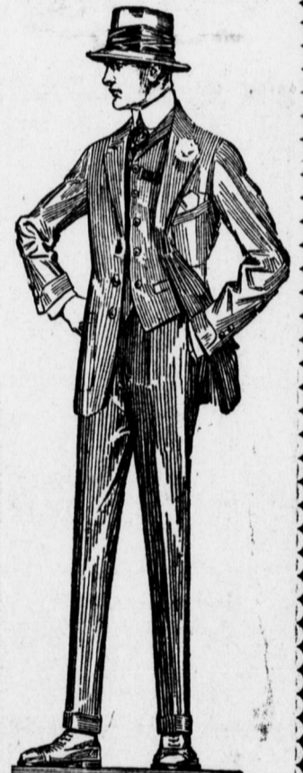
BOWMAN'S Third Floor.

New Soft Hats for men and young men, high crown with pencil curl brims, in blue, green, gray and brown, at ..... $1.50, $1.69 and $2.00 Caps of every description ..... 25c to $1.50 Men's Trousers, for work and dress wear, Worsted, Casimeres and Serges ..... $1.98 Other trousers at, pair ..... 98c to $5.00