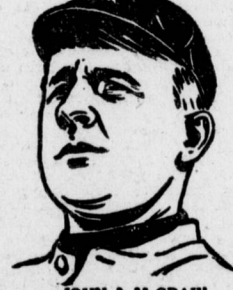
JOHN J. MCGRAW

"Tuxedo gets me in a natural, pleasant way. It's what I call good, honest, companionable tobacco—the kind to stick to."