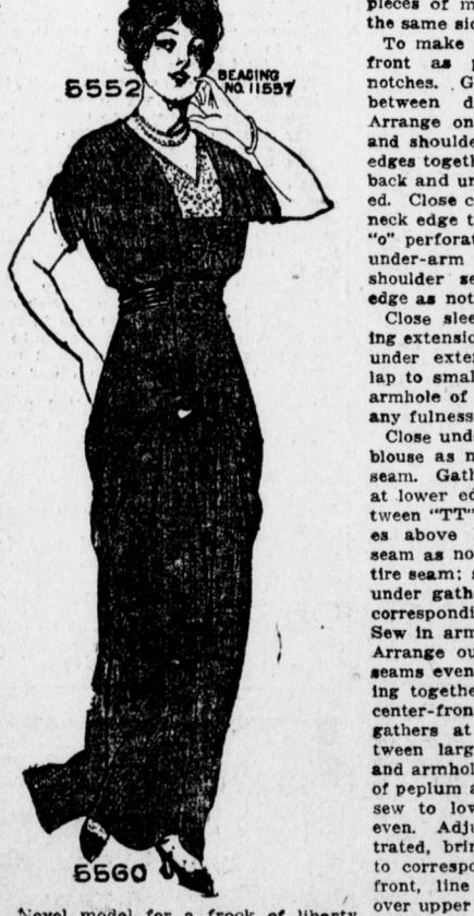
Novel model for a frock of liberty satin trimmed with bead embroidery.