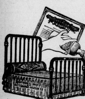
Guaranteed brass bed. 18 filling rods in head and foot, and extra heavy mounts on post and foot. A $42.00 value. February Sale Price, $33.50

Second Street Near Chestnut BURNS & CO. BURNS BLOCK