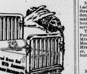
Guaranteed brass bed. Heavy mounts, velvet finish, square top rail. A $29.50 value. February Sale Price, $25.00