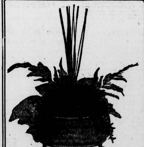
A February Sale Special and a wonderful value it is. A brass fernery. Dull finish, with removable metal lining and prepared natural plant. Decidedly ornamental to any room. Regular value of the two pieces, $1.25. February Sale Price, 59¢