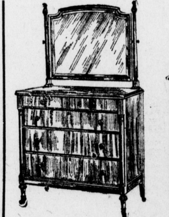
Mahogany dresser and chiffonier. Dull finish, roll top. Made to match with brass beds. Regular value of the two pieces, $65.00. February Sale Price, $49.00