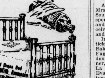
Guaranteed brass bed. 2-inch posts, combination finish, heavily mounted. A $34.00 value. February Sale Price, $26.00