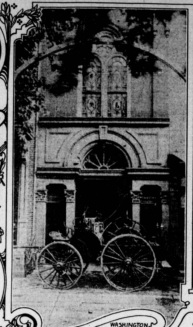
WASHINGTON HOSE COMPANY HOSE NUMBER 4