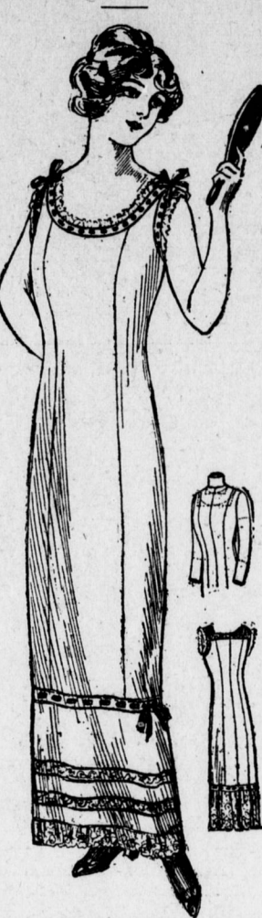
8139 Princesse Slip, 34 to 44 bust.

ANOTHER NEW TYPE OF PRINCESS SLIP One Must Wear Lingerie of This Kind With One-piece Frocks