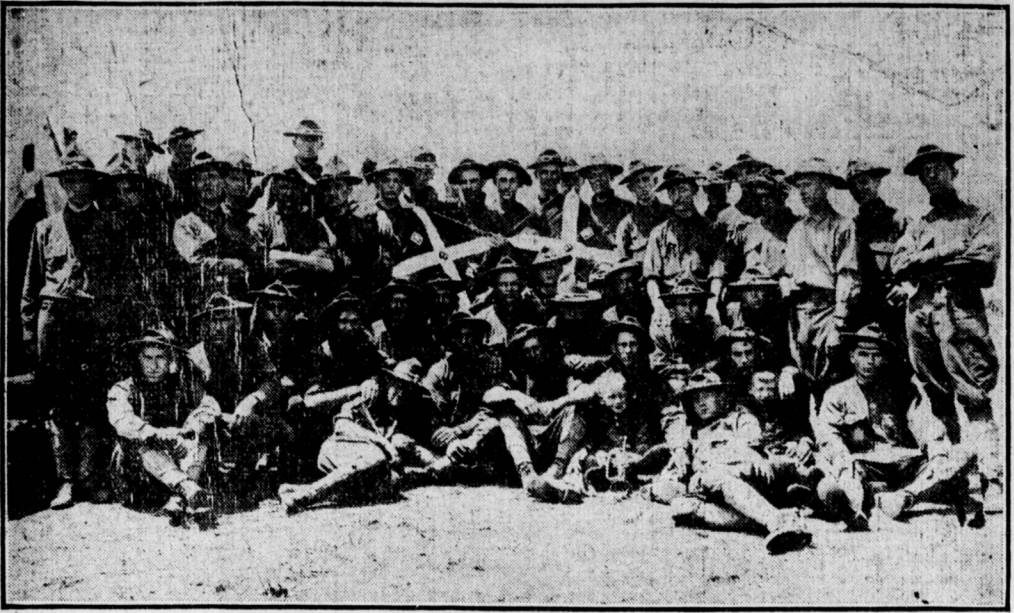
GROUP OF MEMBERS AT LAST CAMP OF INSTRUCTION—FOURTH BRIGADE, AT SELINGSGROVE, PA., JULY, 1913.