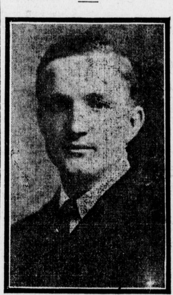
Famous Dickinson Coach Joined the Ranks of the Benedictines in Philadelphia Yesterday.