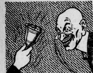
"Eat! Why, That's My Middle Name Now, But I Always Take a Stuart's Dyspepsia Tablet After Meals to Play Safe."

Food in itself is harmless. The reason stomach troubles arise is due to faulty digestion brought about by overworking the body or brain, sickness, overeating, late hours, etc.