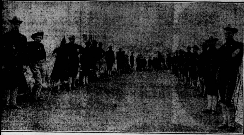
STREET OF COMPANY D IN CAMP AT SHENANDOAH IN ANTHRACITE COAL STRIKE OF 1902.