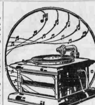
Buy this $20 "Eclipse" Graphophone