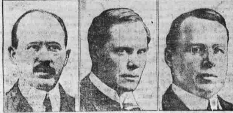
F. E. McGovern, Wis. Wm. Sulzer, New York James M. Cox, Ohio