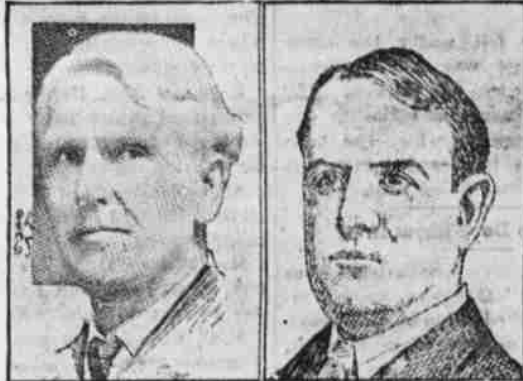
W. N. Ferris, Michigan John K. Tener, Penn.

One of the most notable gatherings of governors for the year is looked for at Erie, Pa., July 9, when Gov. John K. Tener and the patriotic citizens of Pennsylvania will entertain the executives of seven states who have joined to make the success of the Perry's Victory centennial celebrations. Rhode Island, the native home of Perry, will head the list. Ohio, New York, Kentucky, Michigan, Illinois and Wisconsin are expected to join. For the governors, the military force of the western half of Pennsylvania, numbering 4,000 men, and the naval militia of the Great Lakes, more than 3,000 bluejackets, with 2,000 other troops will be reviewed.