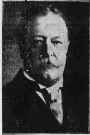
WILLIAM HOWARD TAFT.