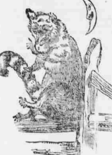
THAT SAME OLD COON.