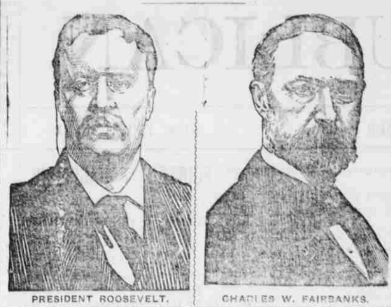
PRESIDENT ROOSEVELT. CHARLES W. FAIRBANKS.