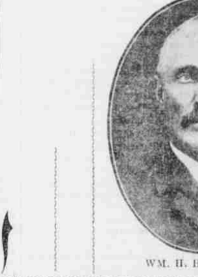
WM. H. HARRISON.

Catarrh Cannot Be Cured with LOCAL APPLICATIONS, as they cannot reach the seat of the disease. Catarrh is a blood or constitutional disease, and in order to cure it you must take internal remedies.