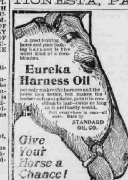
Eureka Harness Oil. Give Your Horse a Chance!