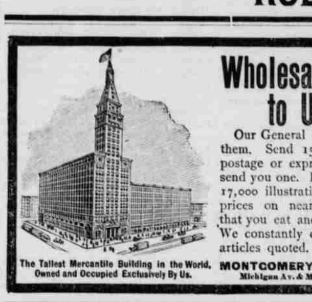
The Tallest Mercantile Building in the World. Owned and Occupied Exclusively By Us. MONTGOMERY WARD & CO., Michigan Av. & Madison St., Chicago