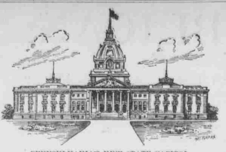
PENNSYLVANIA'S NEW STATE CAPITOL

The above cut represents the design that was supposed to have been selected for the new State Capitol at Harrisburg. It develops that no design has as yet been settled upon, all of those submitted by the architects—30 in number—having been above the $550,000 limit which Governor Hastings placed upon the cost of the new building. The appearances now are that the legislature of 1899 will not occupy the new quarters which it was thought would be ready by that time.