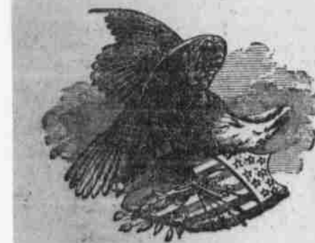
The Eagle Once More Screams Over the Glorious Victory!

The Country Once More Treated to a Glorious Bath of Revivifying Republican Sunshine.