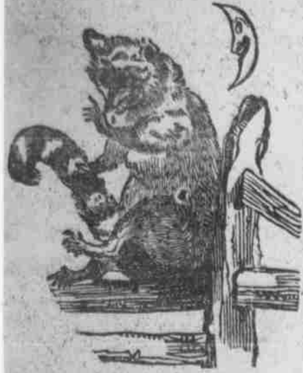
'THAT SAME OLD COON!'