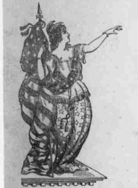
The Goddess of Liberty Points with Pride to the Glorious Record!

The Country Once More Treated to a Glorious Bath of Revivifying Republican Sunshine.