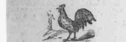
And the Little Democratic Rooster Rejoices Over Mississippi!

Another year has gone by and the people have just finished another battle of ballots. The victory for the Republican party seems at this writing to be complete, and the tidal wave that swept over the country last year, has turned about face and is now sweeping and rolling back over the course and as it passes the Republican majorities bob up serenely. Pennsylvania, Massachusetts, Connecticut, Minnesota and New York are all Republican by handsome majorities, while Virginia, New Jersey, Maryland and Mississippi, have gone Democratic as usual, but with greatly reduced majorities. Nebraska, also, remains with the Republican by a large majority. Pennsylvania's majority will be from 12,000 to 15,000. Thus it is the