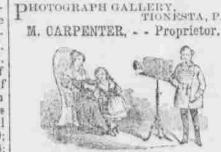
Picture taken in all the latest styles of the heart.