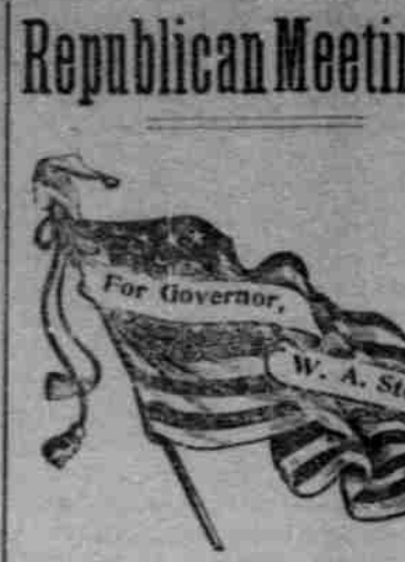
THE REPUBLICAN PARTY AND UNION FOREVER.