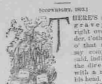
HERE'S an old grave yard right over the top of the mountain. The little people lived here.

College of Science and Schools of Anthropology, University of Indiana who have been in the mountains of Tennessee for many years.