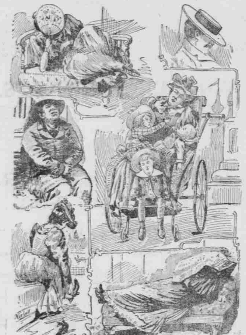
AFTERNOON SCENES AT THE WORLD'S FAIR

if the fair is to pay its debts there to commit an unpardon- ance of at least 100,000 people who pay able sin. The citizens are proud of their way.