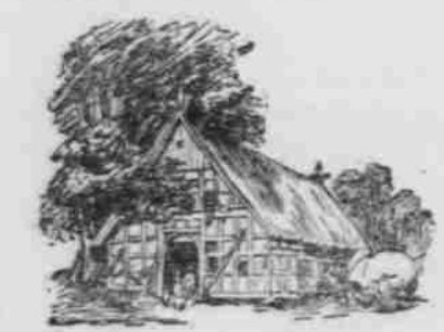
WESTPHALIAN FARN BOUSE

is a product of Germany, even to the tive service. To this the kniser would not listen; he said they could not be spaced from the regiments. Moreover, under no circumstances could they remain away six months. However, being grently interested in the succem of the German village, the kaiser permitted two bands to be formed ou