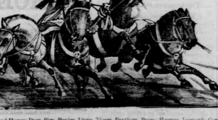
Trained Horses, Dogs, Pigs, Ponies, Lions, Tigers, Panthers, Bears, Horses, Leopards, Camels, Llamas, Monkeys, Kangaroos, Donkeys, Brats and even a few hundred other animals performing in a Ring. 100 Foreign Spectacles extracting Pains on the Elevated Stage. 11 Arranging on all the same Time 1,000 New Exercises and Wonderful Attractions. TREMENDOUS FREE STREET PARADE.