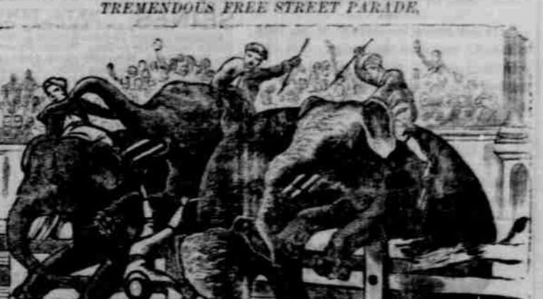
Containing over a mile of Rich Objects and Rare Features, will leave the grounds at 8 a. m. Admission to Evening, 50 cents. Children under 2, 25 cents. Two Exhibitions Daily, at 2 and 8 p. m. Doors open at 12:30 and 7 p. m. For the accommodation of those wishing to avoid the crowds at the season, an office has been established at BIRKENHEAD & THIRZA STREET, NO. 1, MAIZE LANE, BLOCK, where reserved numbered tickets can be bought at the regular price and admission tickets at the usual slight advance, on the morning of the Show. EXCURSION RATES ON ALL RAILROADS.

Will exhibit at Bedford on October 11th.