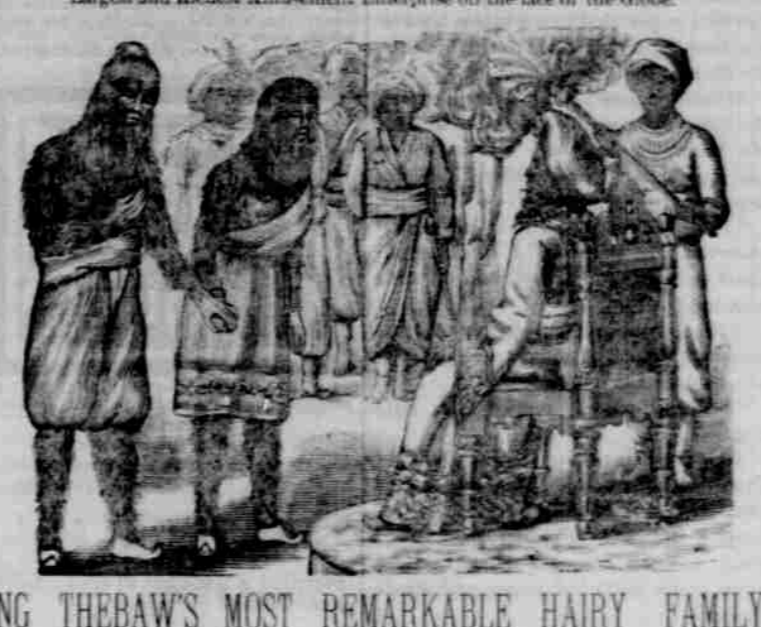
KING THEBAW'S MOST REMARKABLE HAIRY FAMILY. The Most Remarkable Human Being Known to Exist, Revered and Honored as Sacred Mascot, or Luck-Bringer, to the Burnside Empire. Secured at an Expense of $100,000 in Gold. First Time in a Christian Country.

Another Show added this season. CAPITAL, $4,000,000. DAILY EXPENSES, $7,000. Largest and Richest Amusement Enterprise on the face of the Globe.