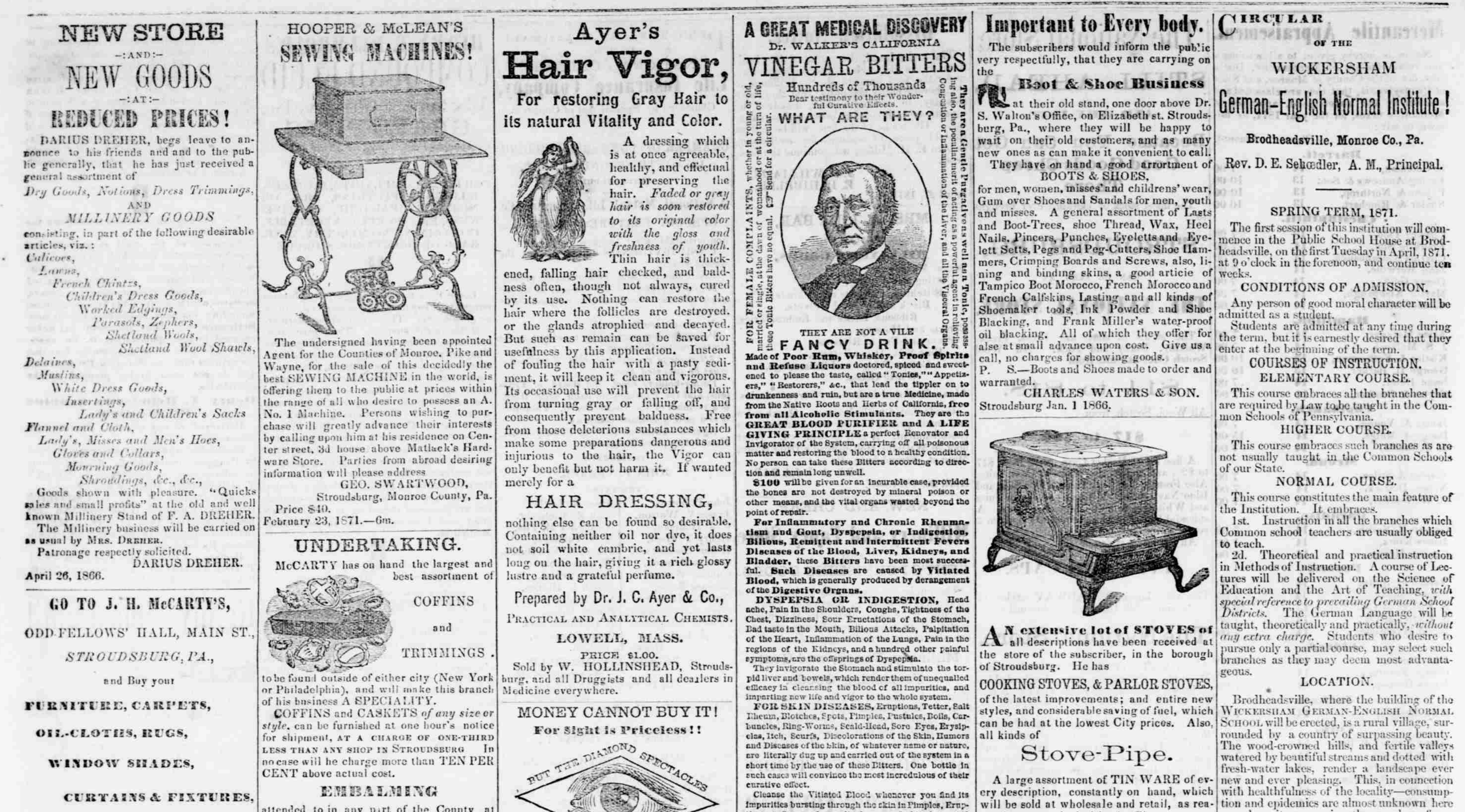
TABLE CLOTHS, &c.,

attended to in any part of the County a the shortest possible notice. [Sept. 26,'67