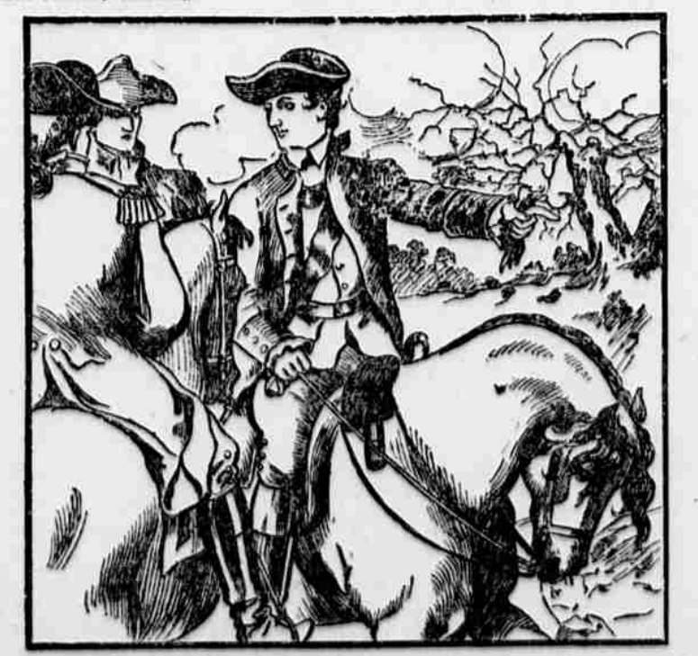
Here is a council of British generals. Find the American Revolutionary of-

FOR THE LITTLE ONES.—Cut out the pictures appearing on this page each day, draw a pencil mark around the hidden object, save them until Saturday, then send them or take them to The Tribune office in an envelope addressed to "Puzzle Department." Enclose in the envelope your name, age and address. The boys and girls who correctly mark the six pictures appearing during the week, and whose answers are first received, will have their names published in The Tribune Monday morning.