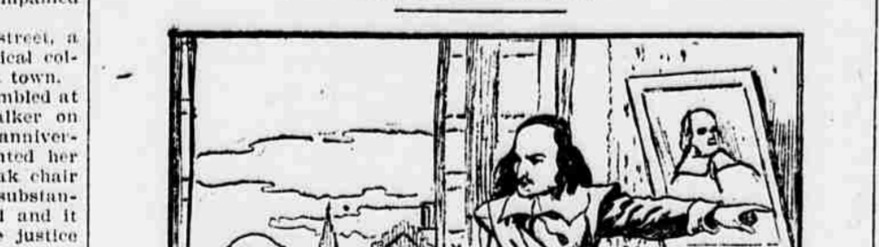
Beckman talked for his two companions when they appeared before Stuyvesant. Find his companions.