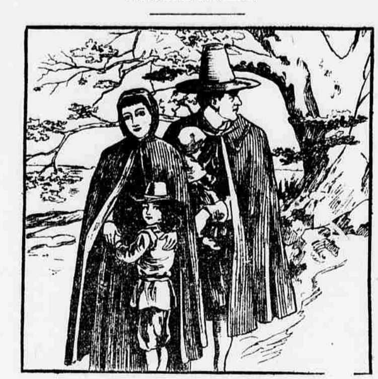
Can you find three other pessengers who were on the Mayflower?

Bradford politicians individually and tion, will occupy it.